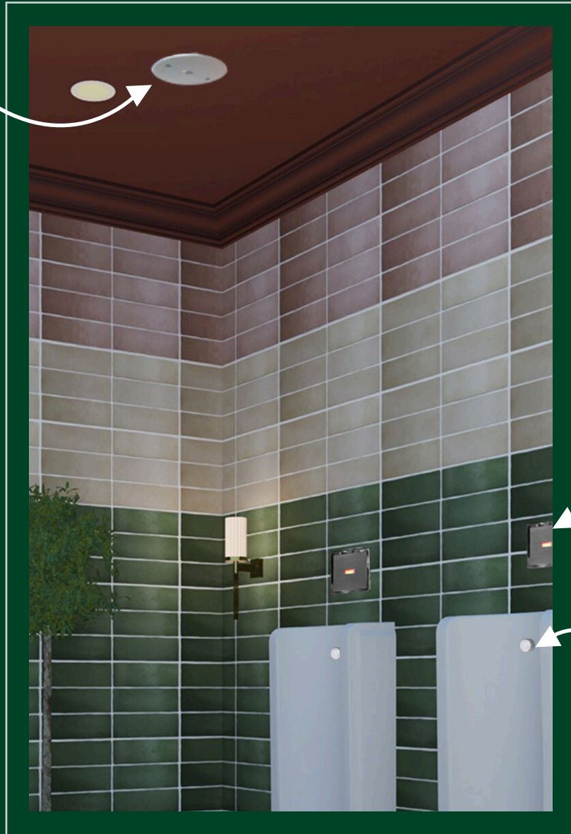
ET3-12 wall sensor